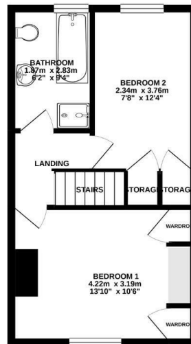
1ST FLOOR 32.1 sq.m. (345 sq.ft.) approx.