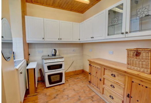
This imposing stone built three bedroom mid terrace property provides substantial family living accommodation arranged over three floors.