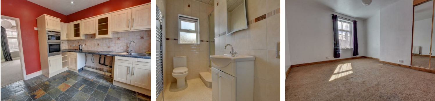
This well appointed two bedroomed stone built mid-terrace property is located in this popular residential area of Colne and occupies a traditional cobbled street. Conveniently positioned on the doorstep of numerous amenities which include schools, bus routes, Sainsbury's, Lidl and North Valley Retail Park. The property is ideally suited for first time buyers or presents an excellent investment opportunity for inverstors/landlords.