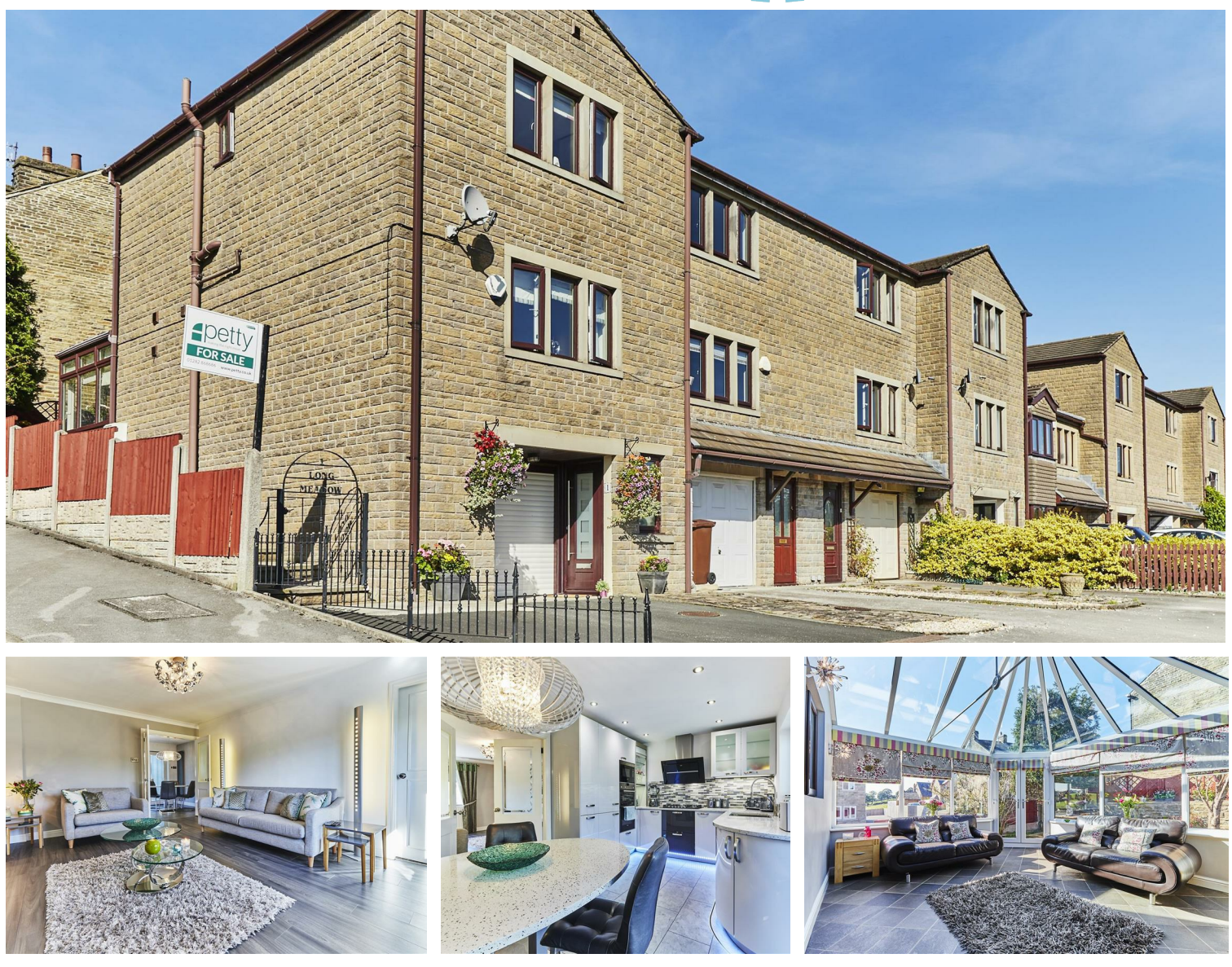
Set in an established and popular residential area this contemporary and stylish three bedroom town house has been extended over the years and will appeal to a variety of purchasers. Recently refurbished with the installation of fully fitted kitchen with Siemens appliances and Amtico flooring and a superb white bathroom suite. The accommodation has been extended to the rear with a substantial conservatory creating an extra