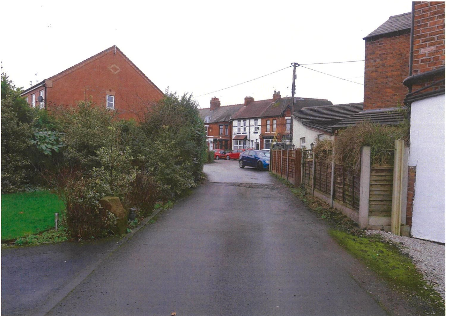
ACCESS ROAD TO REAR OF PROPERTY (BELOW)