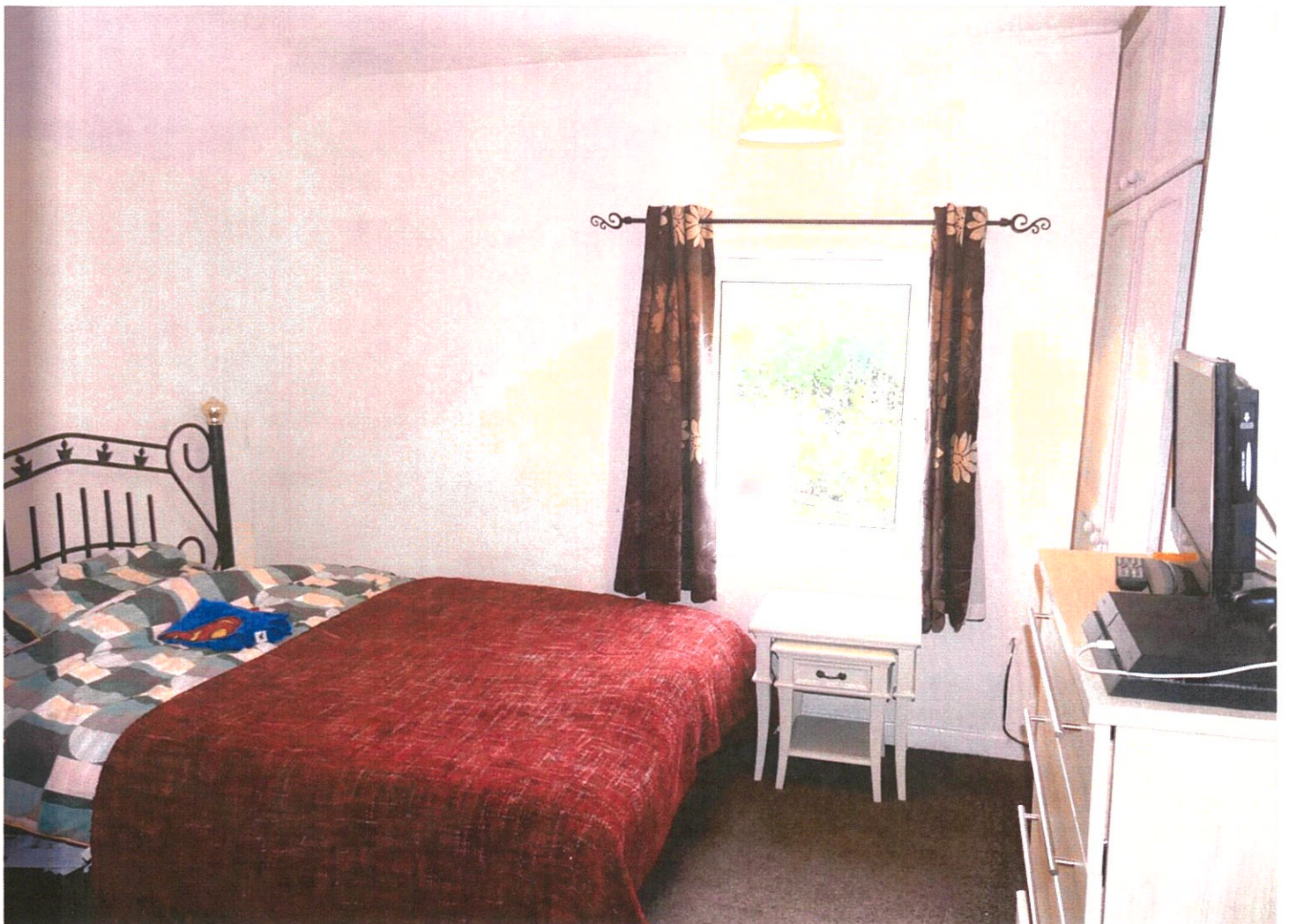
BEDROOM TWO (BELOW)