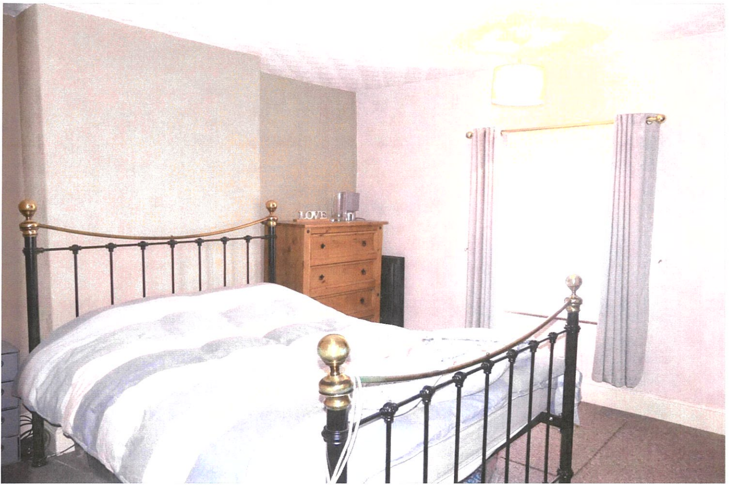
BEDROOM ONE (ABOVE)