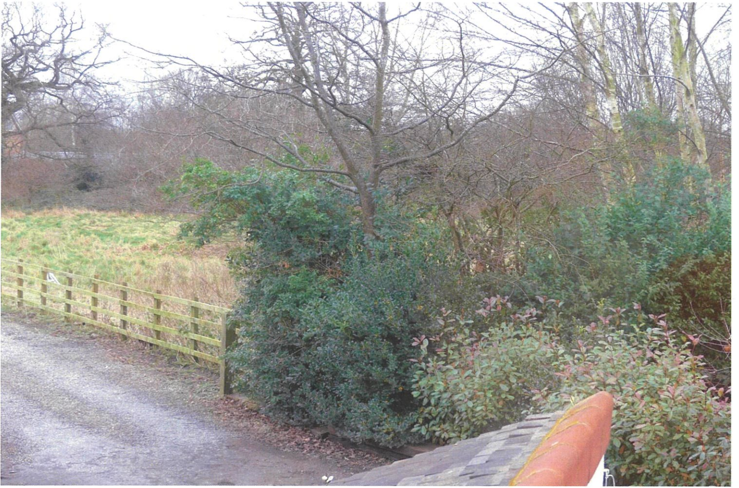
VIEWS FROM REAR ELEVATION (ABOVE)