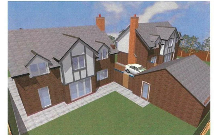
Perspective view 1:2