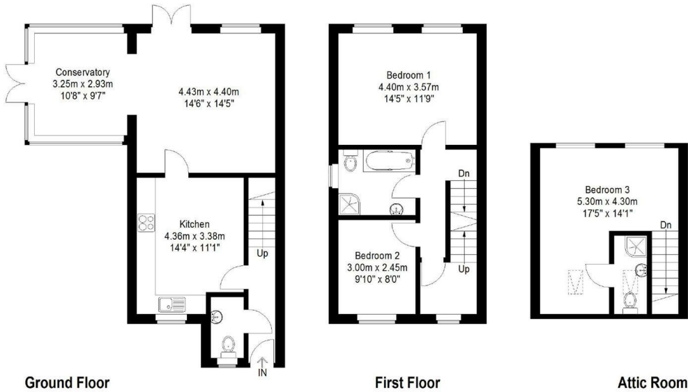
Illustration for identification purposes only, measurements are approximate, not to scale. FloorplansUsketch.com © 2015 (ID 184329 )

Approximate Gross Internal Area = 92.8 sq m / 999 sq ft Attic Room = 23.3 sq m / 251 sq ft Total = 116.1 sq m / 1250 sq ft