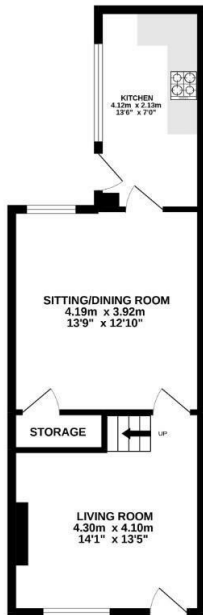
GROUND FLOOR 40.9 sqm. (441 sq.ft.) approx.