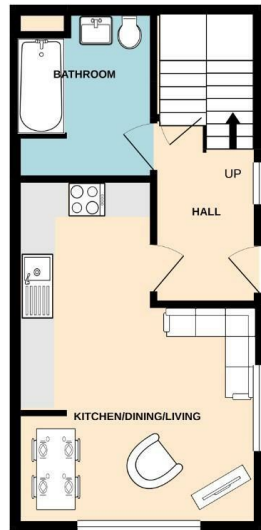
GROUND FLOOR 357 sq.ft. (33.2 sq.m.) approx.