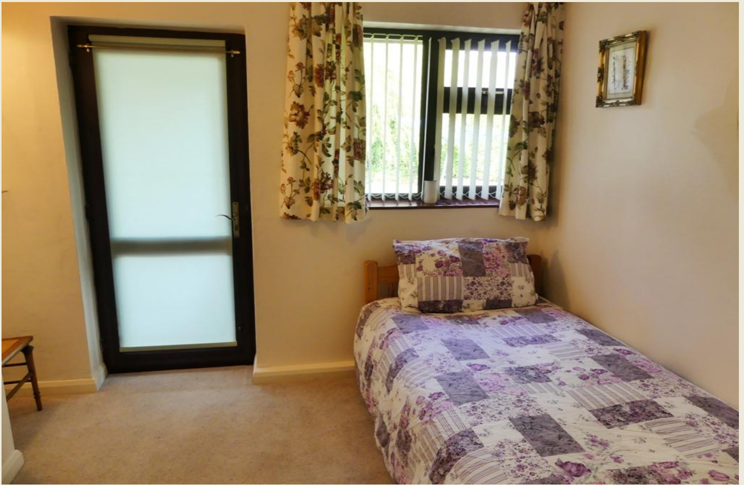
BEDROOM TWO (ABOVE)