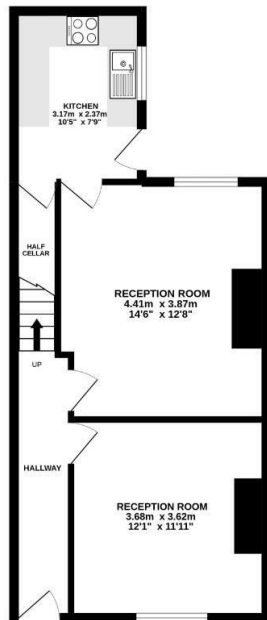
GROUND FLOOR 43.9 sq.m. (472 sq.ft.) approx.