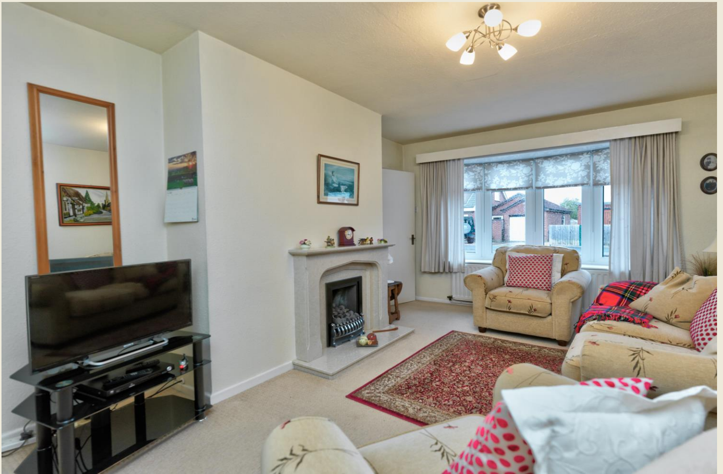
LIVING ROOM (16'5" x 10'11")