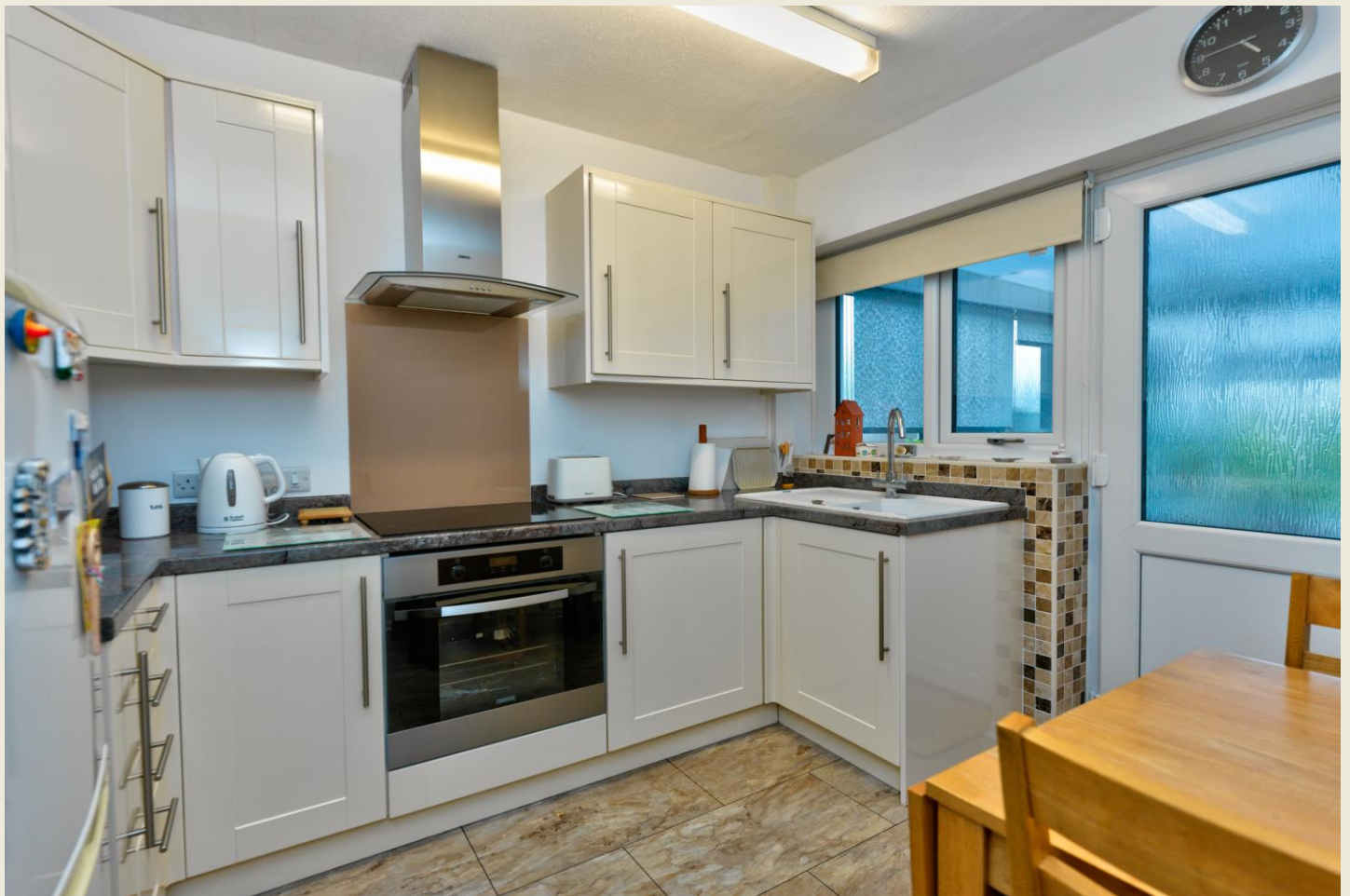
KITCHEN / BREAKFAST ROOM (9'5" x 8'4")