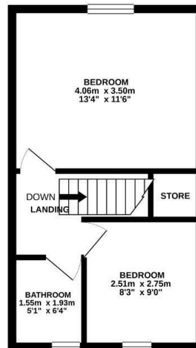
1ST FLOOR 29.6 sq.m. (318 sq.ft.) approx.