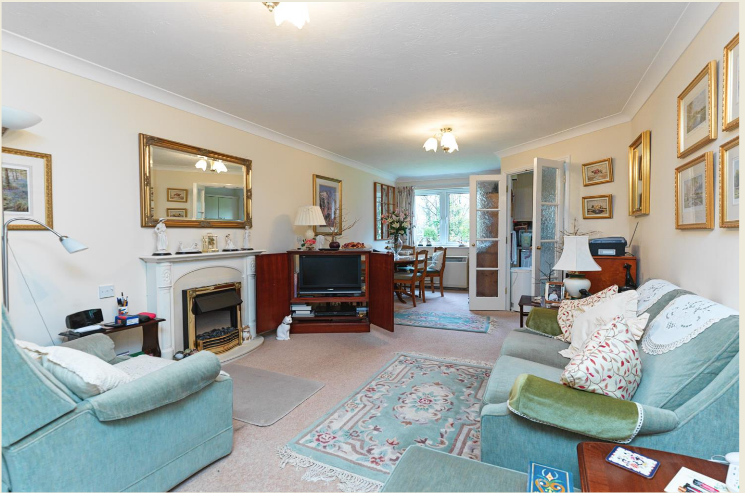
LIVING DINING ROOM (8'0 x 10'10 max)