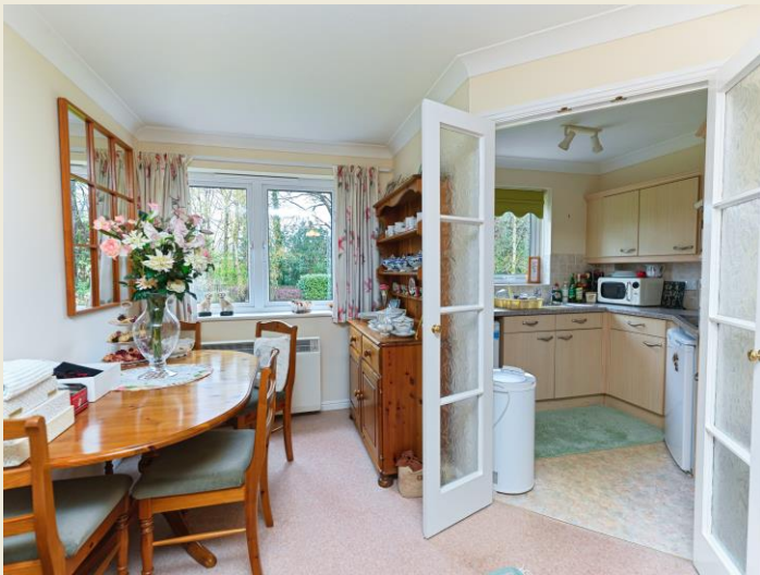
FITTED KITCHEN (8'2 x 7'7)