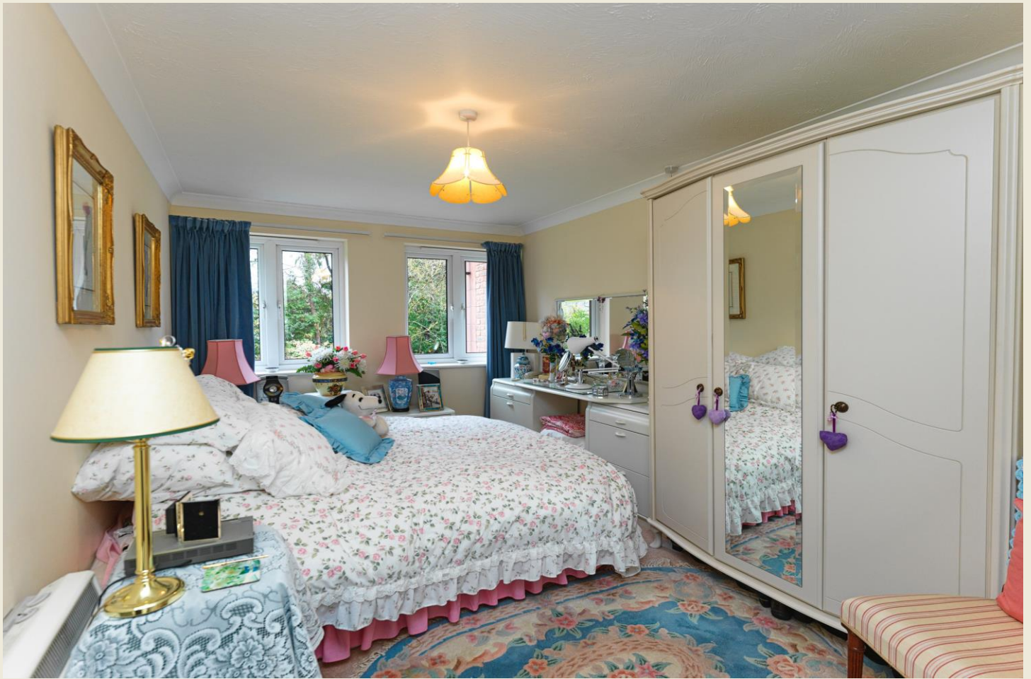
BEDROOM ONE (15'5 x 9'2)