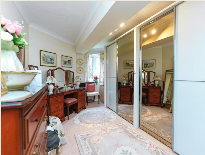
BEDROOM TWO (15'5 x 9'2 max)