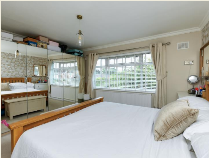
BEDROOM TWO (11'6 x 11'6 max)