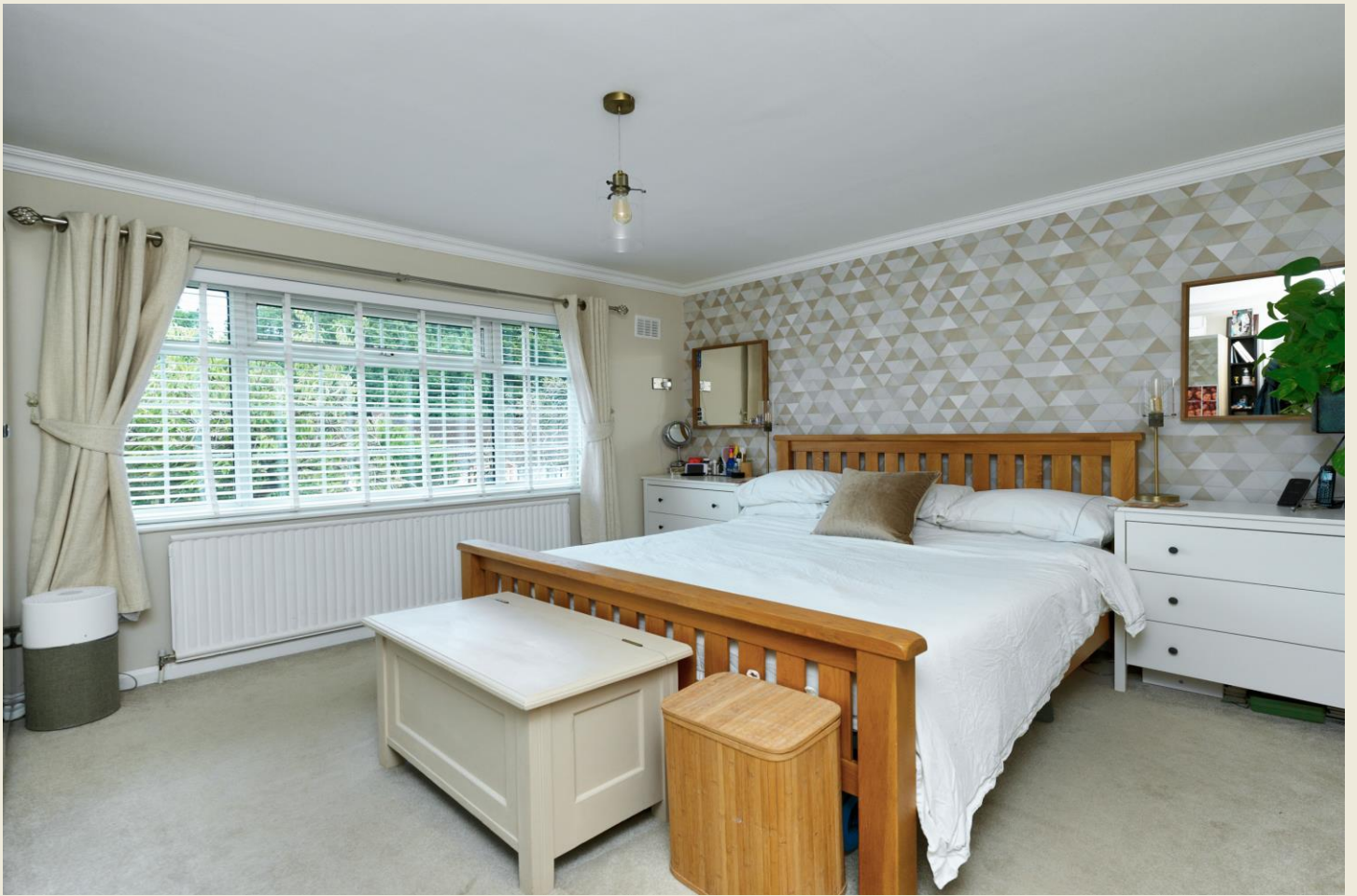
BEDROOM ONE (12'6 x 13'9)