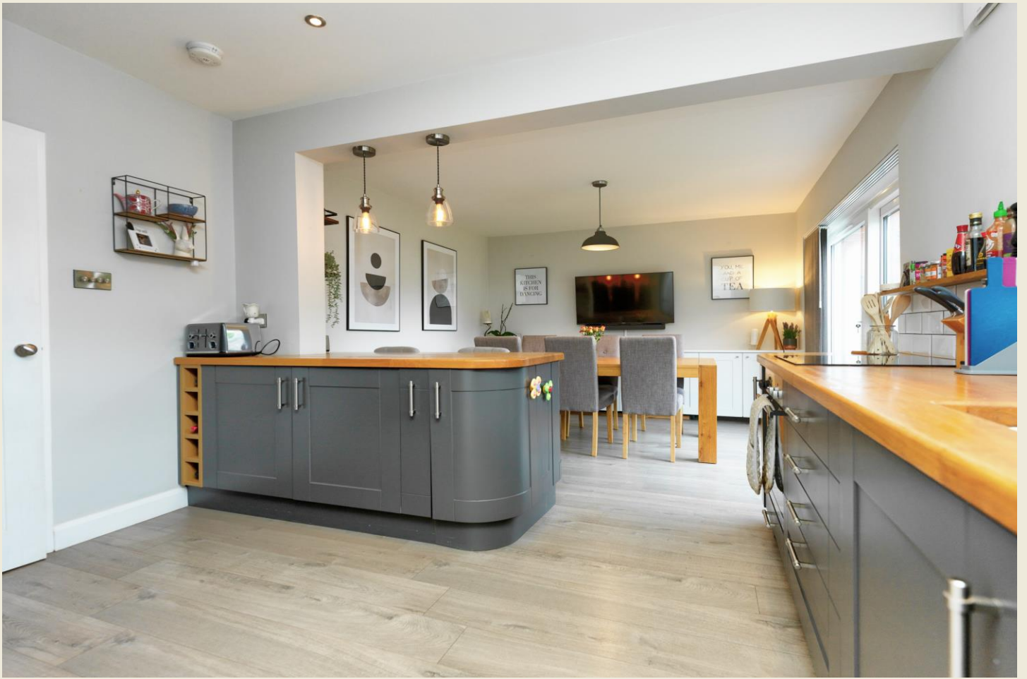
KITCHEN DINING ROOM (11'6 x 21'8 max)