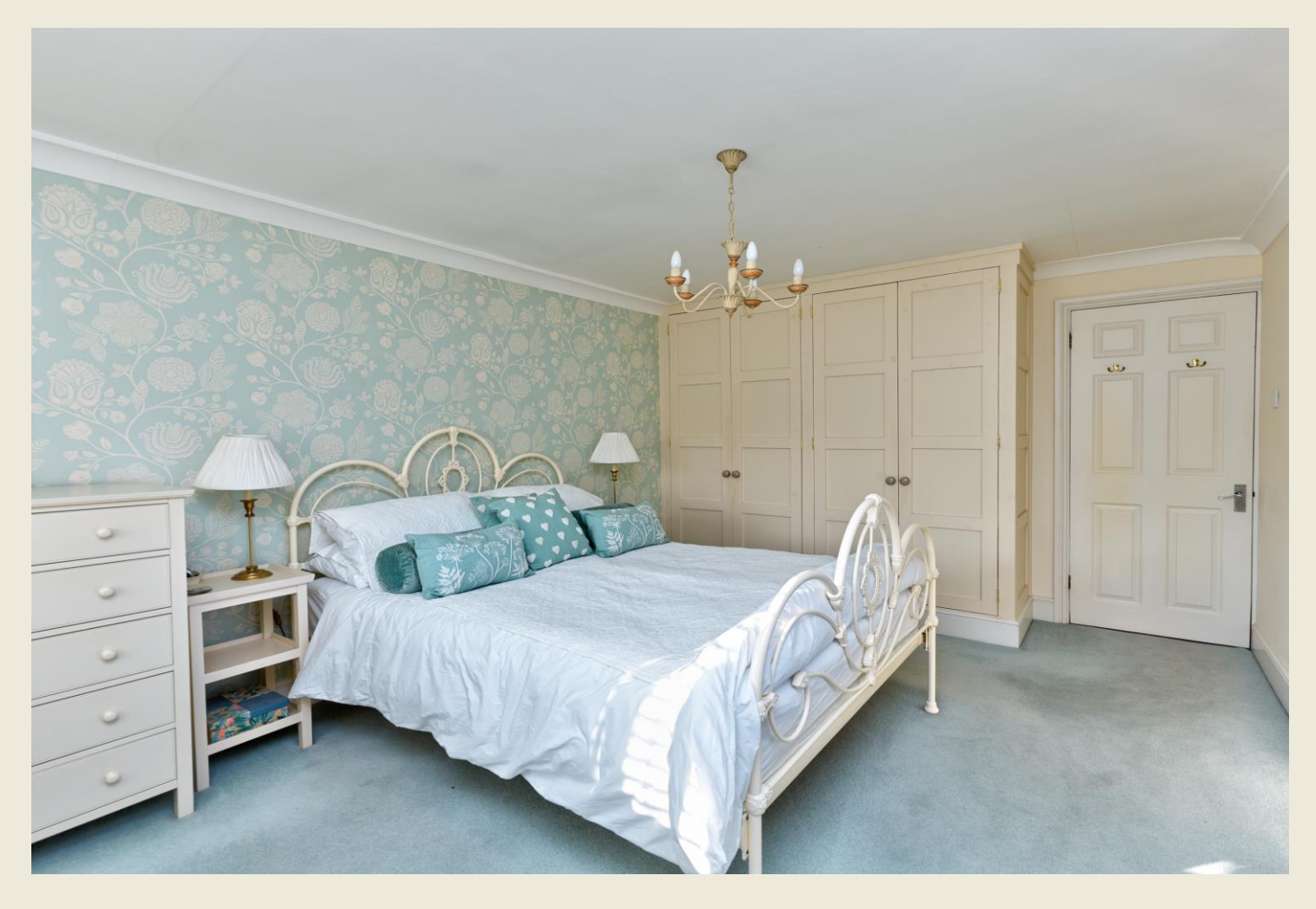
BEDROOM ONE (14'1 x 10'6)