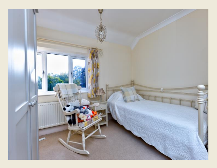
BEDROOM FOUR (6'7 x 8'10)