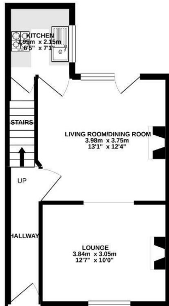
GROUND FLOOR 35.3 sq.m. (380 sq.ft.) approx.