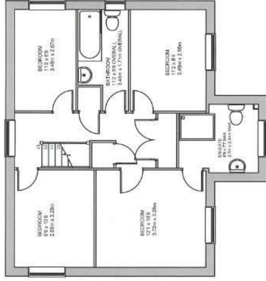
1ST FLOOR APPROX. FLOOR AREA 625 SQ.FT. (58 SQ.M)

TOTAL APPROX. FLOOR AREA 1281 SQ.FT. (120 SQ.M)