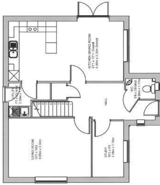
GROUND FLOOR APPROX. FLOOR AREA 656 SQ.FT. (62 SQ.M)