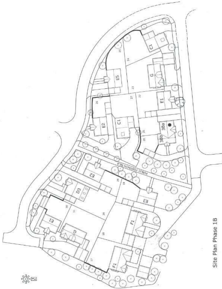
Site Plan Phase 1B