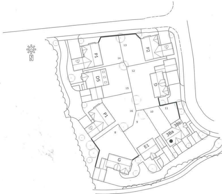
Site Plan Phase 1C