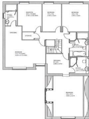
1ST FLOOR APPROX. FLOOR AREA 1162 SQ.FT. (108 SQ.M)