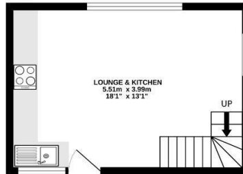
1ST FLOOR 22.0 sq.m. (237 sq.ft.) approx.