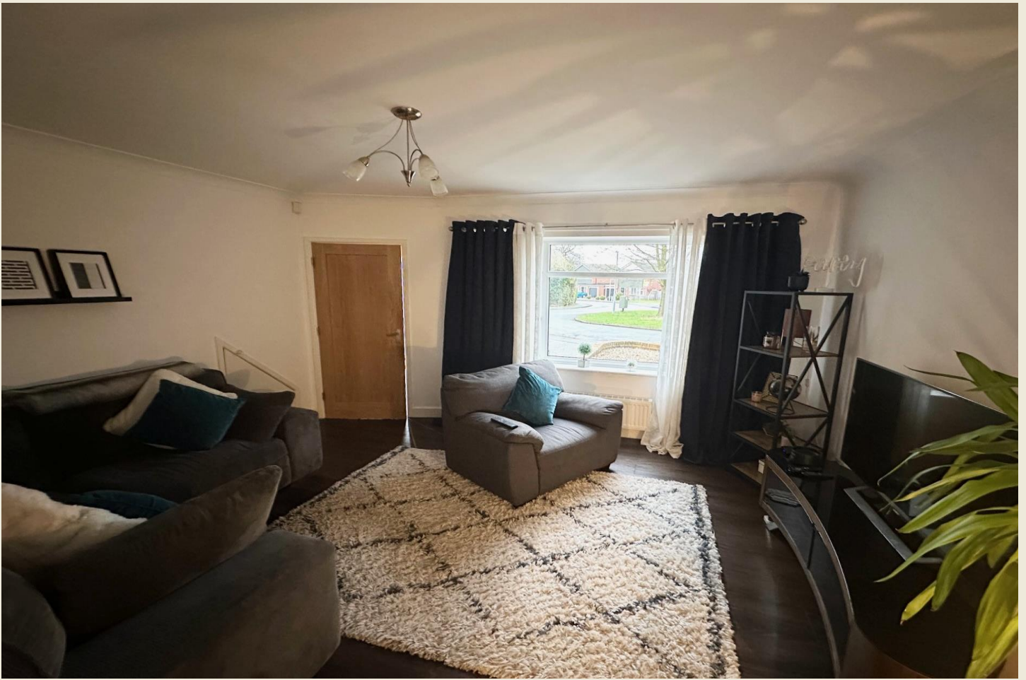
LIVING ROOM (13'10 x 11'4)