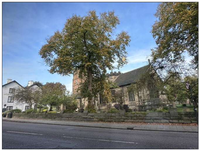
(PA3345RET - LETTING -02/11/23-Draft.1)

Note: Fairhurst Buckley for themselves and for the vendors or lessors of this property whose agents they are, give notice that: (1) the particulars are set out for the guidance only of intending purchasers or tenants, and do not constitute part of any offer or contract. (2) all details are given in good faith and are believed to be materially correct but any intending purchasers or tenants should not rely on them as statements of fact and must satisfy themselves as to the accuracy of each of them. (3) no person in the employ of Fairhurst Buckley has any authority to make representations or give any warranties in relation to this property.