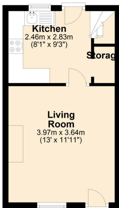
Ground Floor Approx. 23.7 sq. metres (255.3 sq. feet)