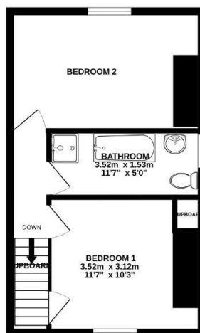
1ST FLOOR 30.7 sq.m. (330 sq.ft.) approx.