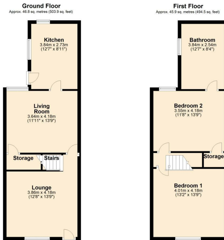
Total area: approx. 92.8 sq. metres (998.4 sq. feet)