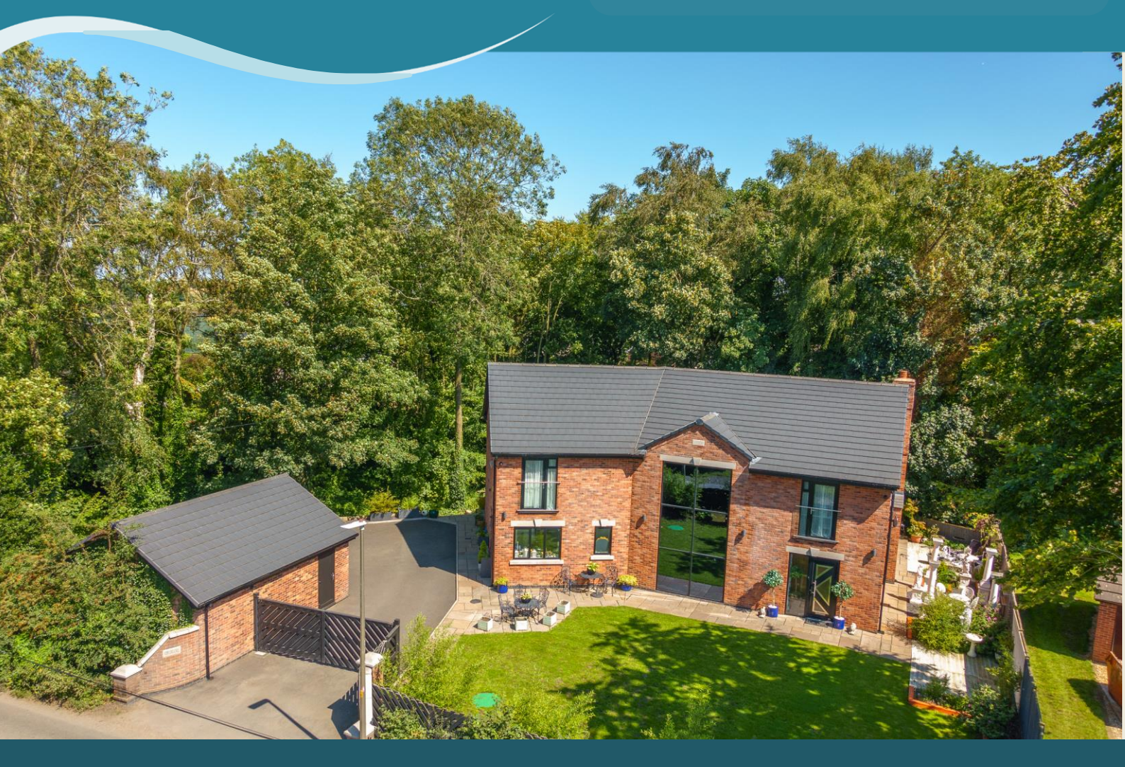
'OAKMOORE' | WRENBURY ROAD | ASTON | NANTWICH | CHESHIRE | CW5 8DQ | OIRO £995,000