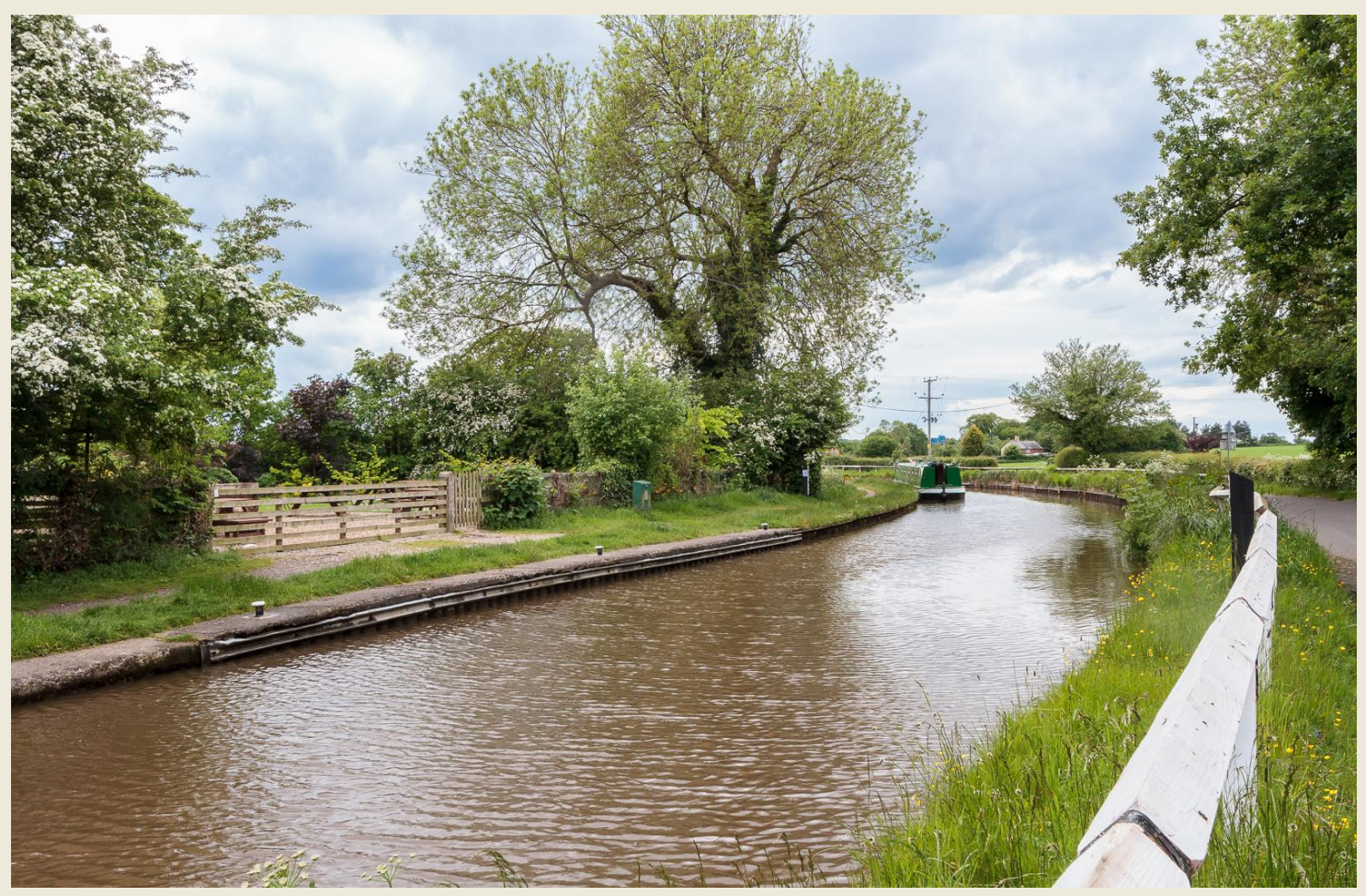
NEARBY WRENBURY VILLAGE