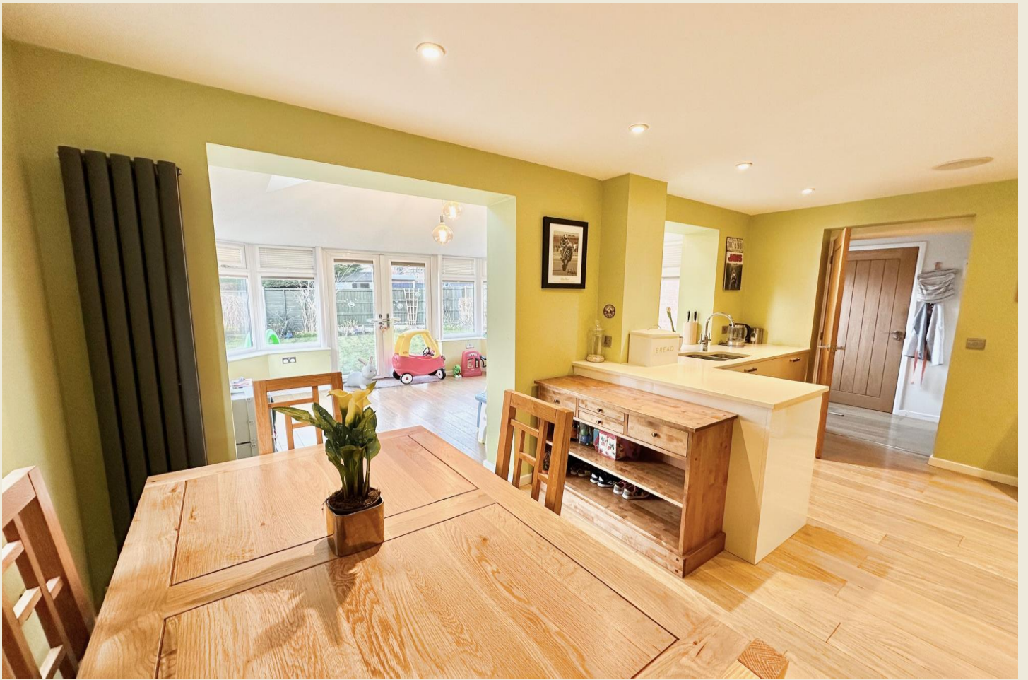
KITCHEN DINING ROOM (15'5 x 9'7)