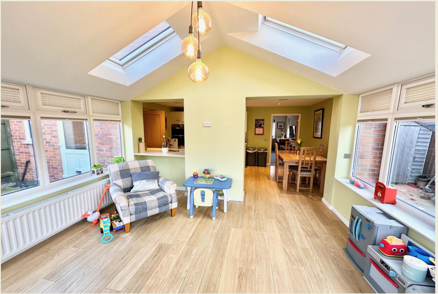
GARDEN / FAMILY ROOM (12'3 max x 11'1)