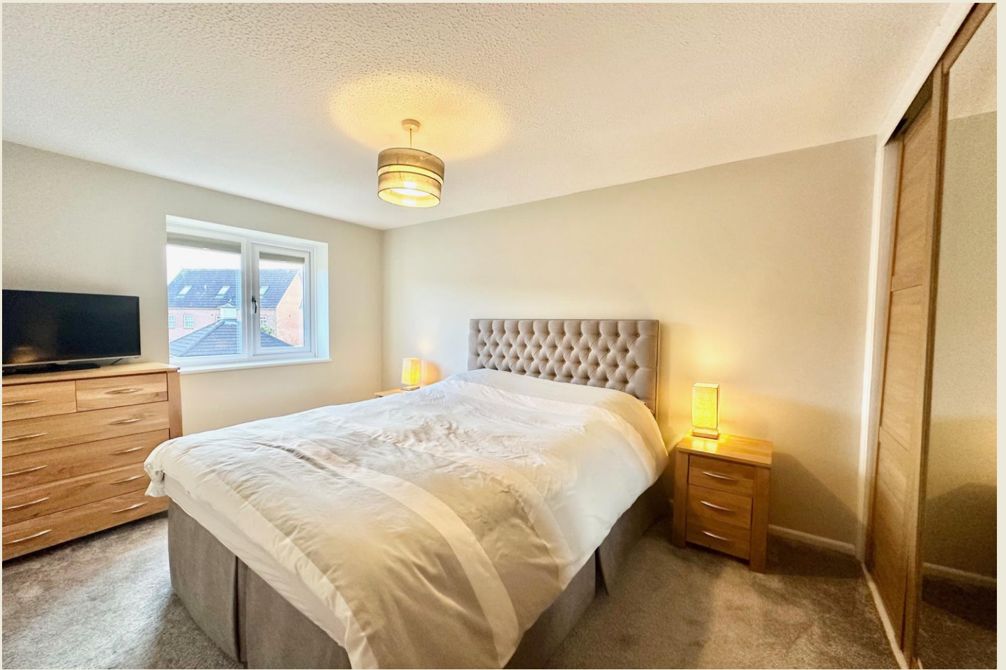
BEDROOM ONE (12'10 max to front of wardrobe) x 8'10 max