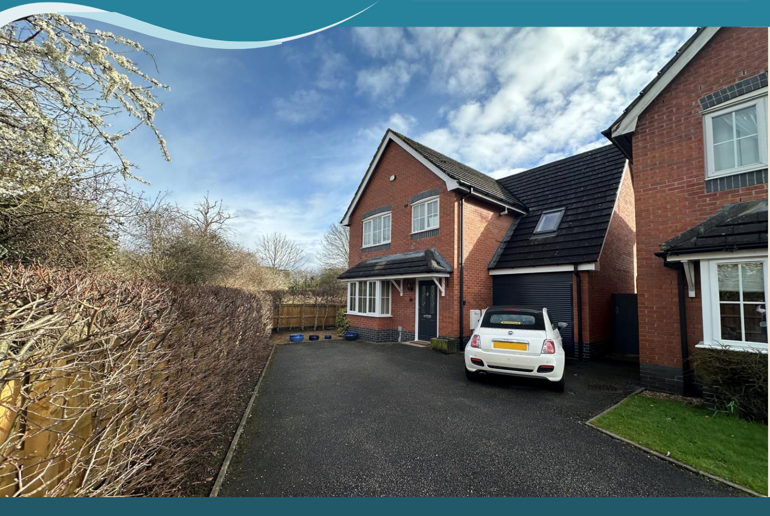
4 GARNETT CLOSE | STAPELEY | NANTWICH | CHESHIRE | CW5 7RF | OIRO £355,000