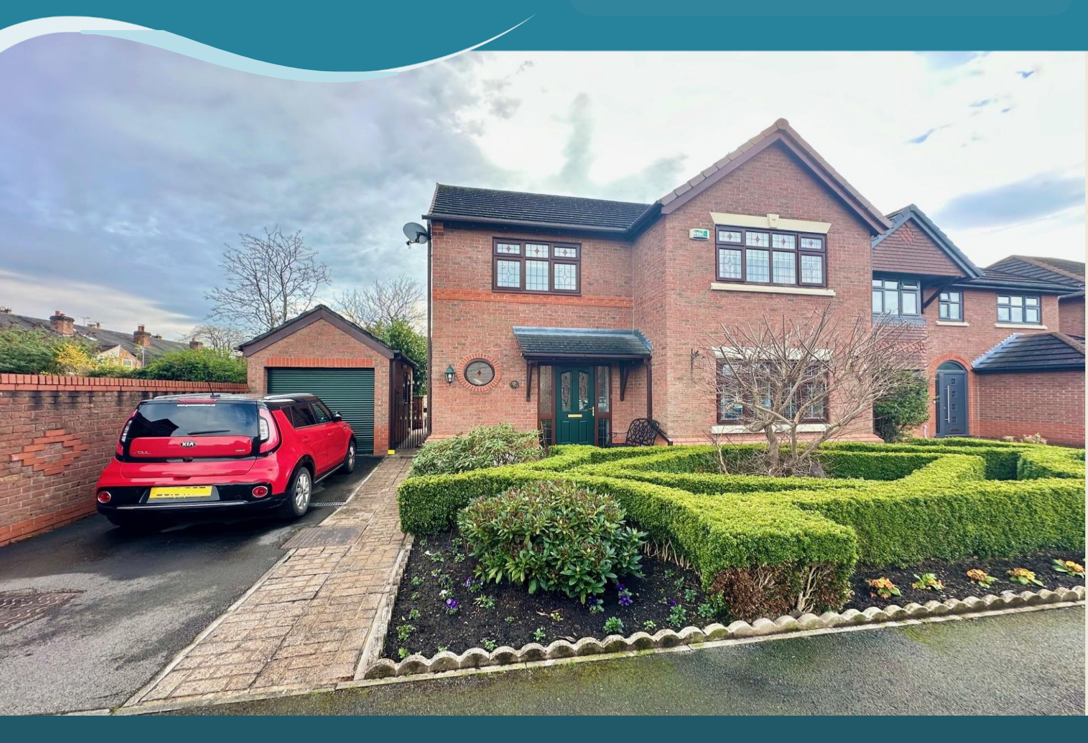
I JOHN GRESTY DRIVE | WILLASTON | NANTWICH | CHESHIRE | CW5 6RH | OIRO £419,950