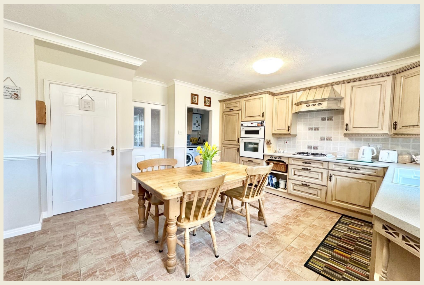
KITCHEN DINER (14'5 x 11'19)