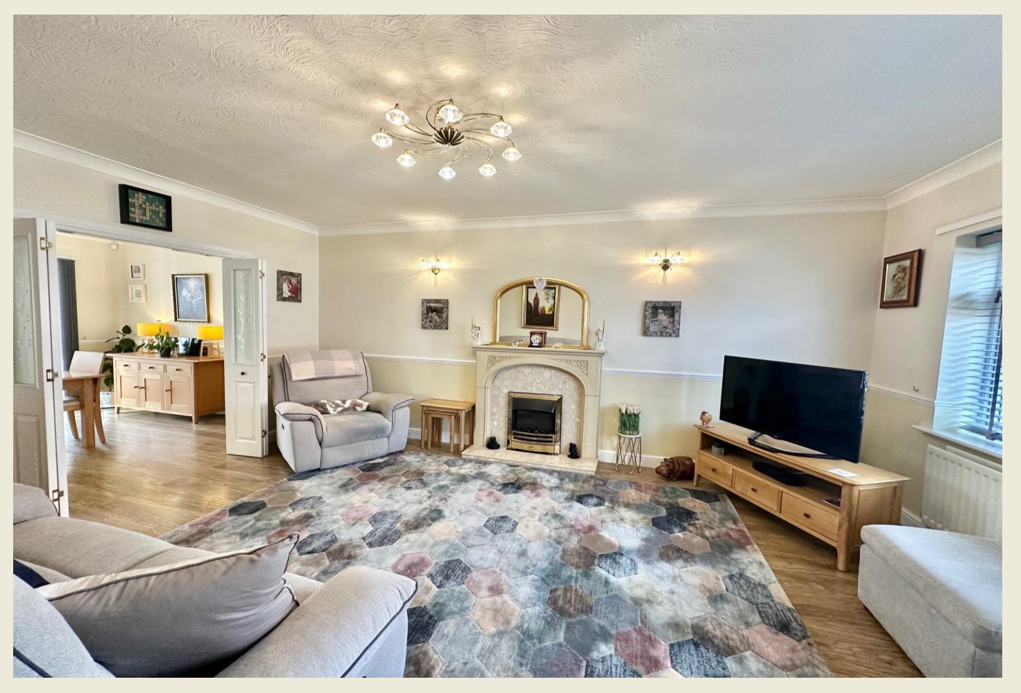
LIVING ROOM (17'1 x 11'10)