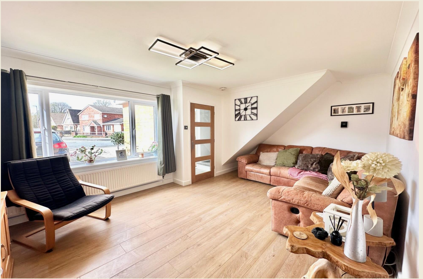
LIVING ROOM (16'9 x 11'2)