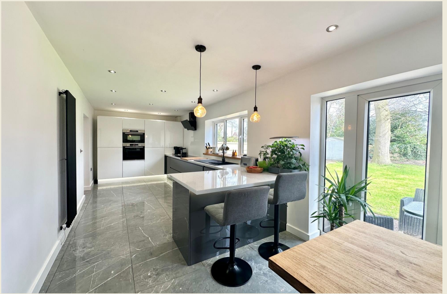
KITCHEN DINER (25'7 x 8'7)