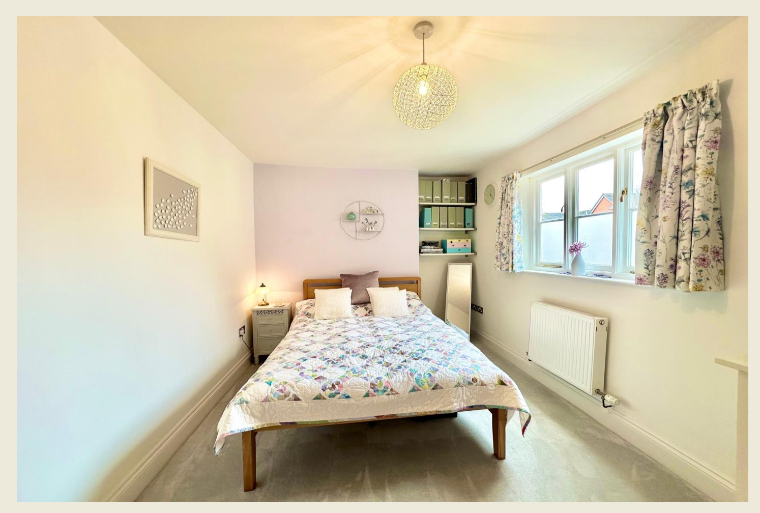
BEDROOM TWO (16'5 x 9'6)