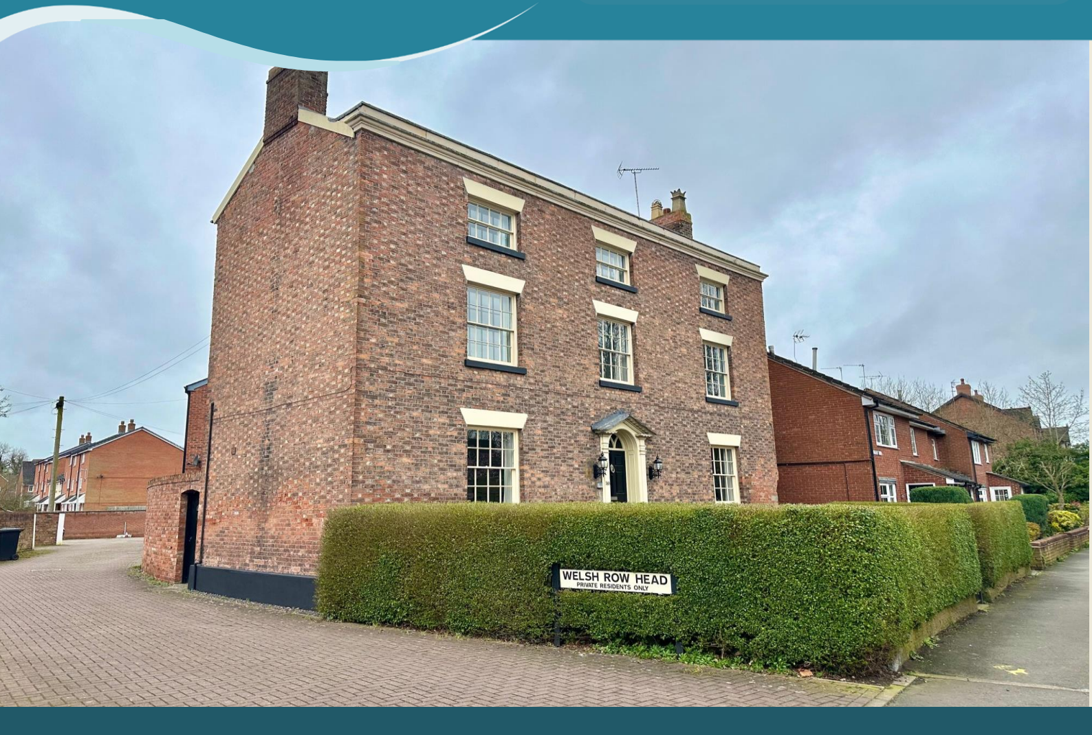
APARTMENT I, 165 WELSH ROW | NANTWICH | CHESHIRE | CW5 5HB | OIRO £325,000