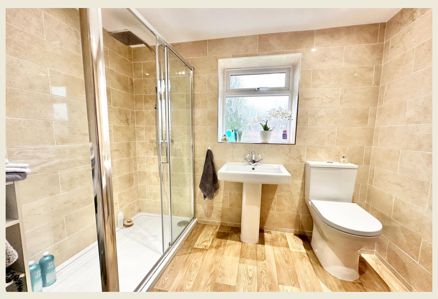
SHOWER ROOM (7'10 \times 5'7)