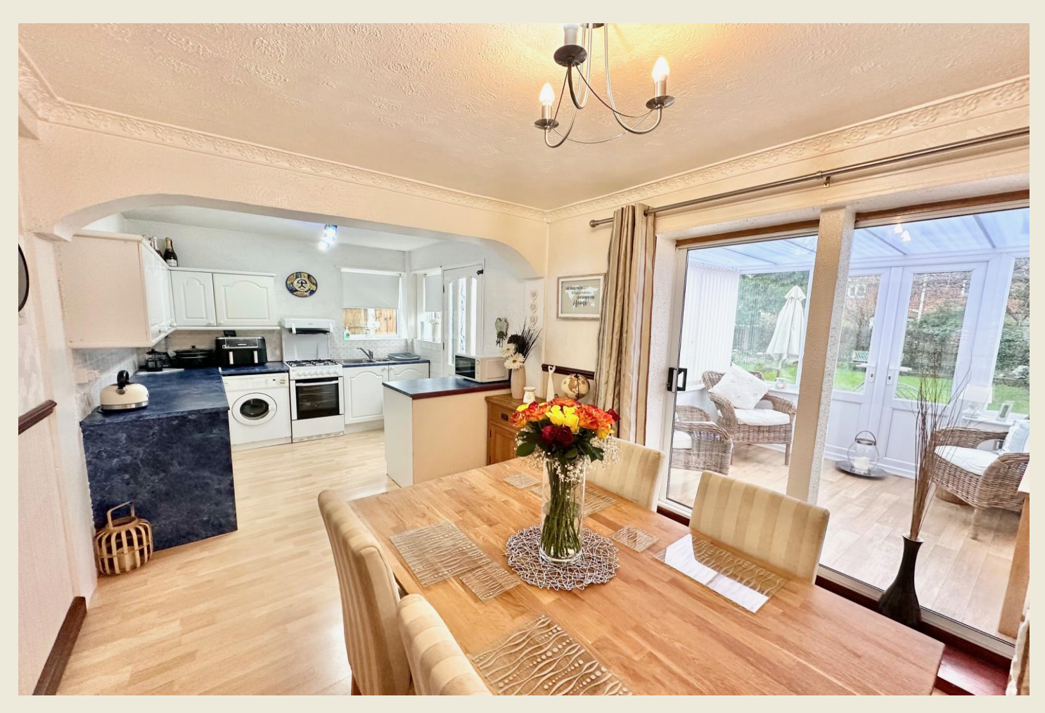
KITCHEN DINER (19' x 8'10)