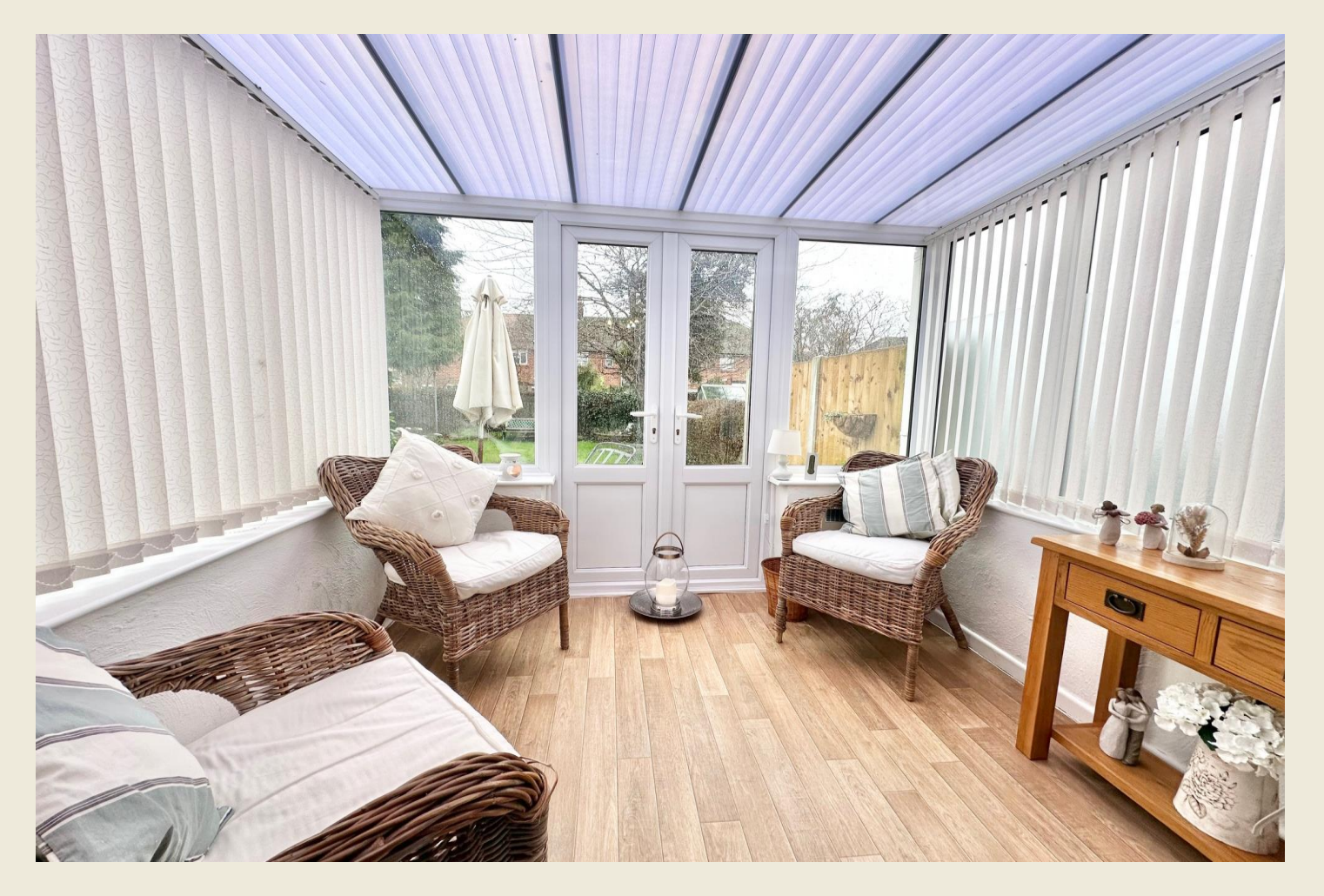
CONSERVATORY (8'6 x 7'7)