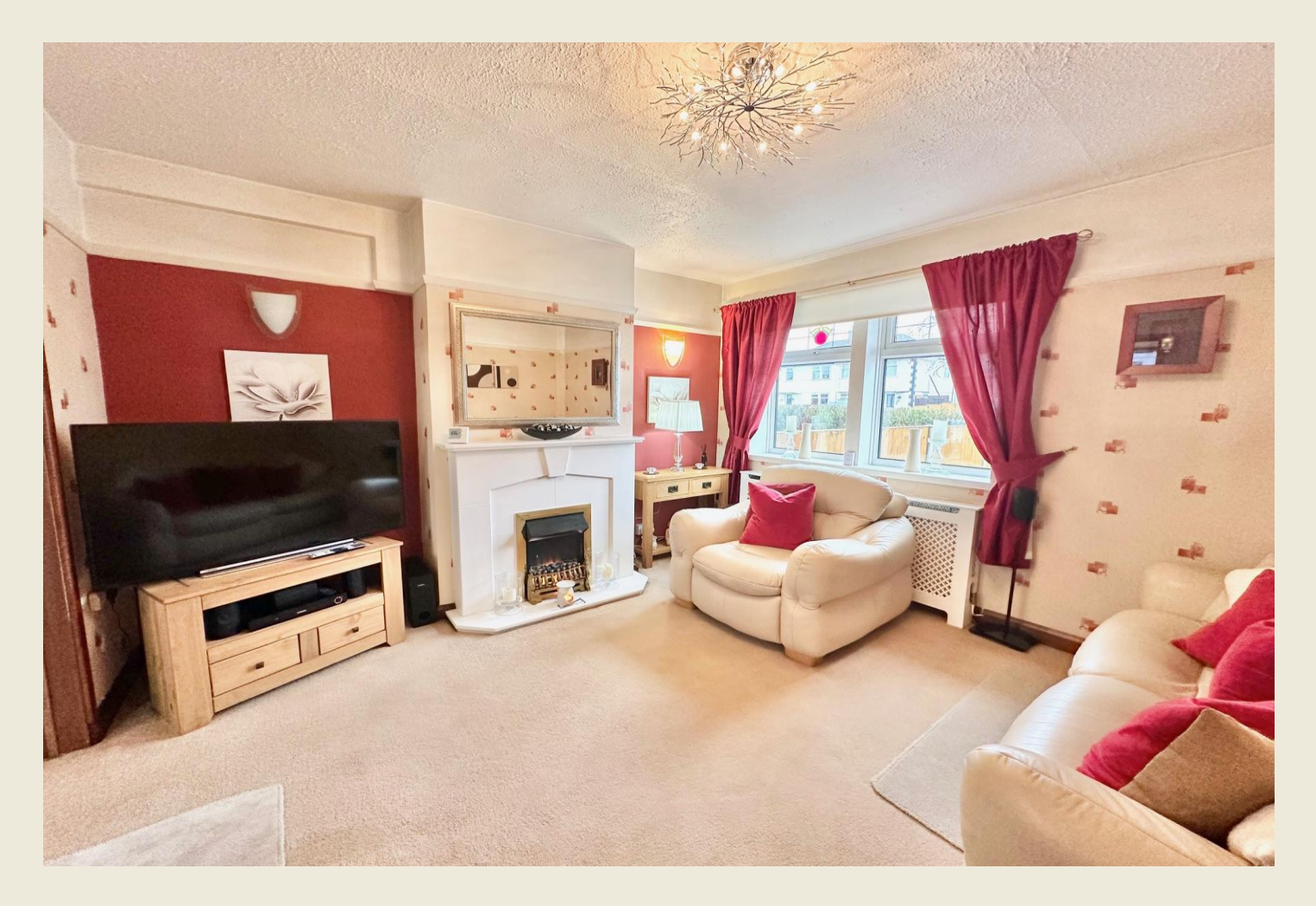
LIVING ROOM (12'6 x 11'10)