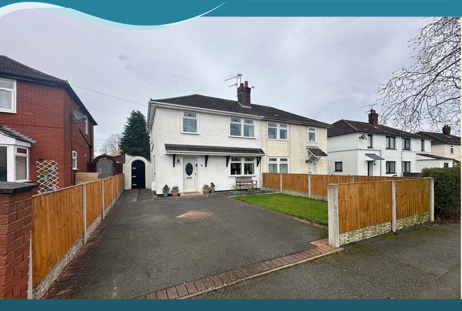
36 ALDERSEY ROAD | CREWE | CHESHIRE | CW2 8NR | OIRO £145,000