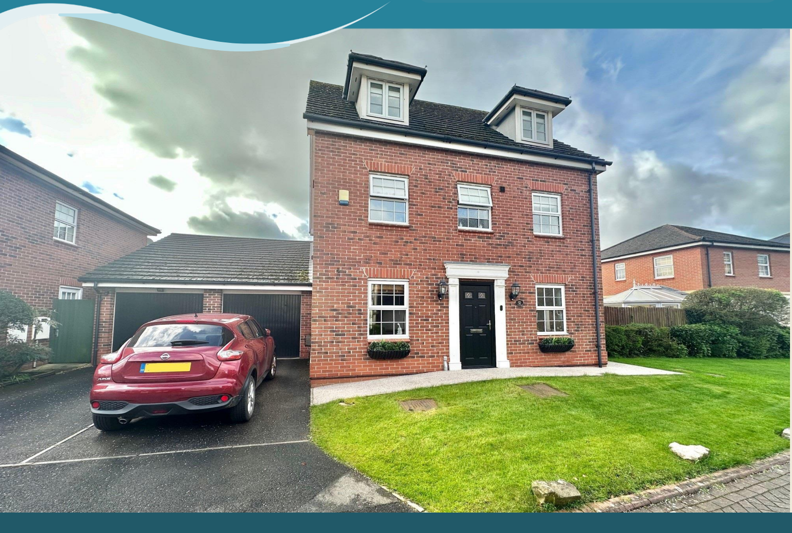
51 CHADWICKE CLOSE | STAPELEY | NANTWICH | CHESHIRE | CW5 7NF | OIRO £465,000