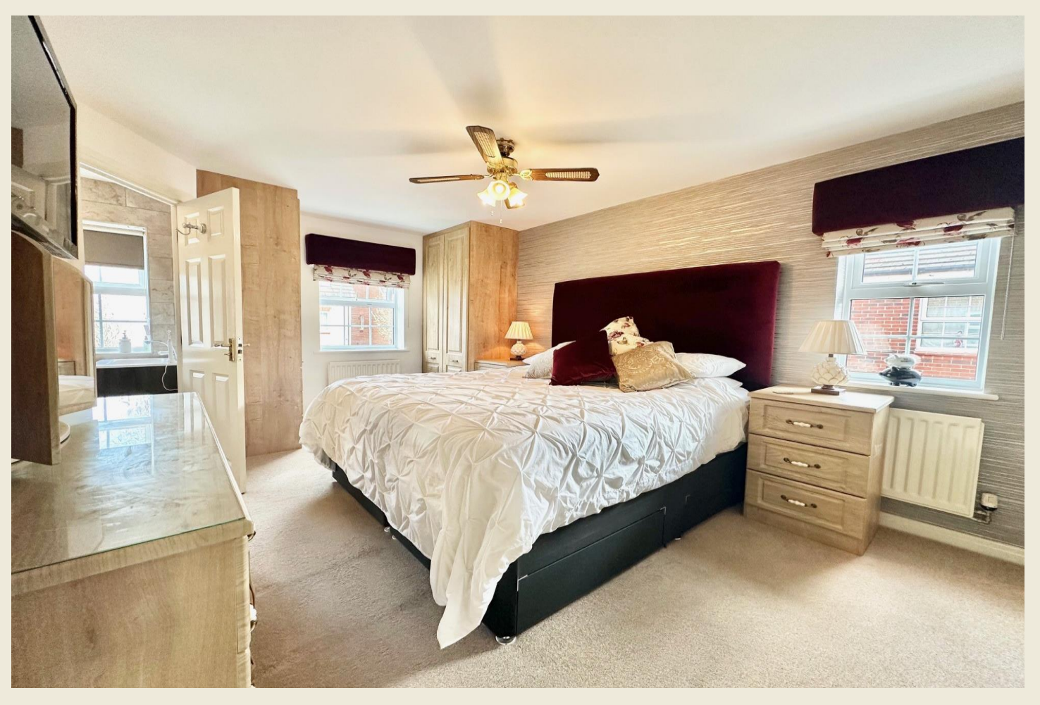
MASTER BEDROOM ONE