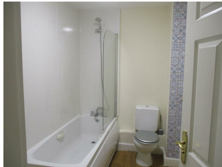
2ND FLOOR DOUBLE BEDROOM