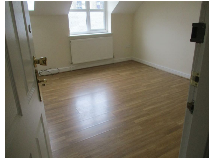
2ND FLOOR EN-SUITE BEDROOM