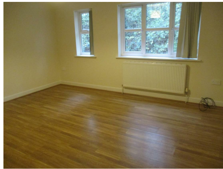
1ST FLOOR SINGLE BEDROOM