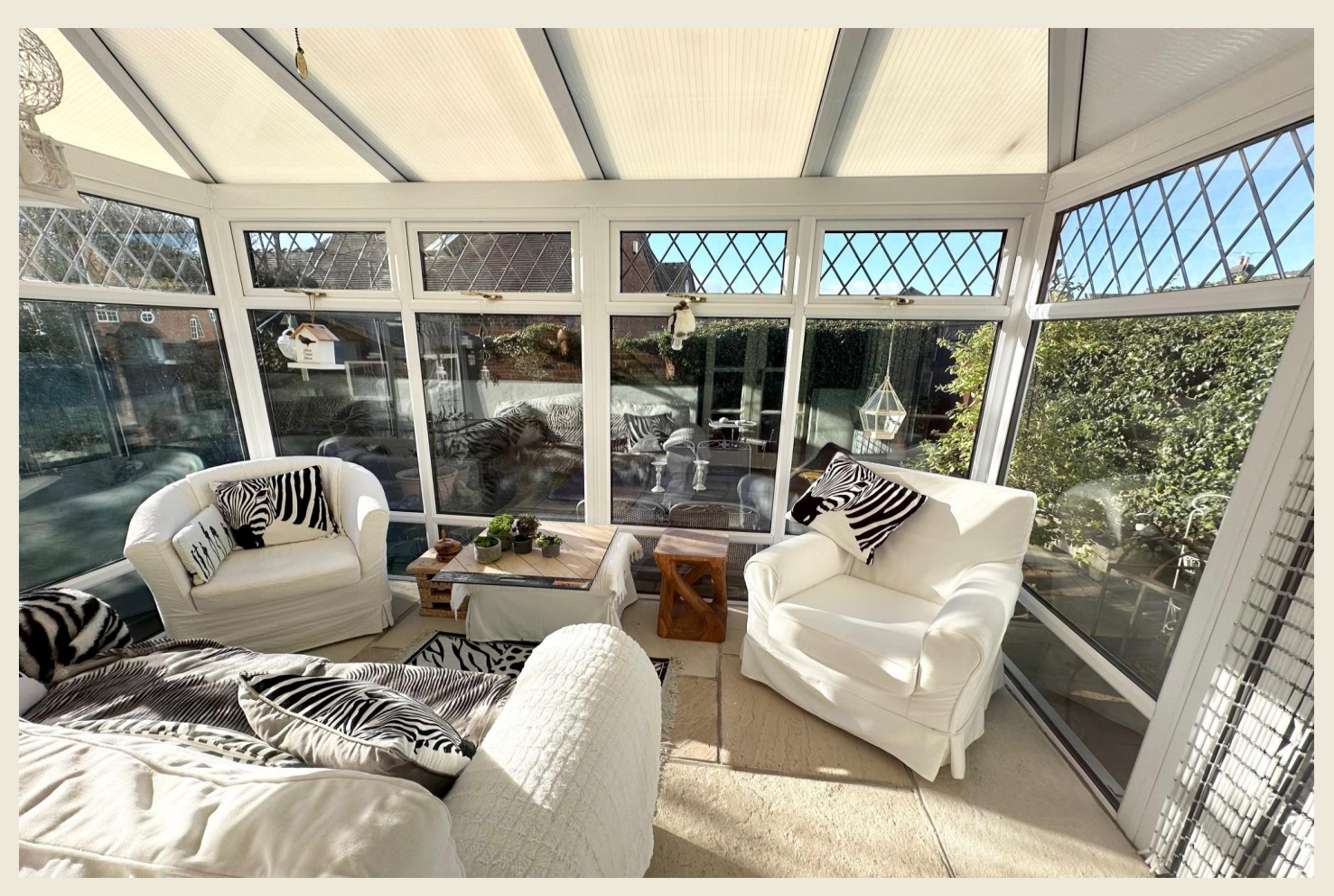
CONSERVATORY (7'3 × 11'2)