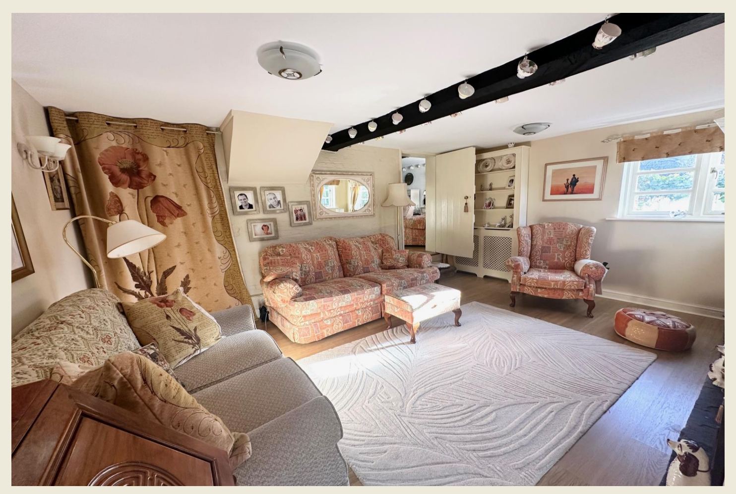
LIVING ROOM (12'2 x 15'1)