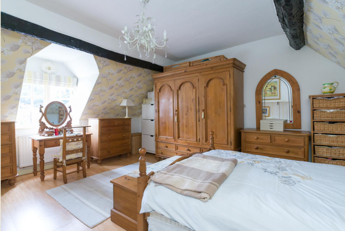
BEDROOM THREE / OFFICE (6'I I × 6'7)