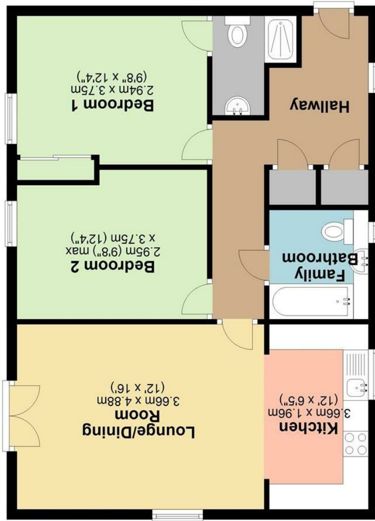
Ground Floor Approx. 67.6 sq. metres (727.5 sq. feet)

Total area: approx. 67.6 sq. metres (727.5 sq. feet)